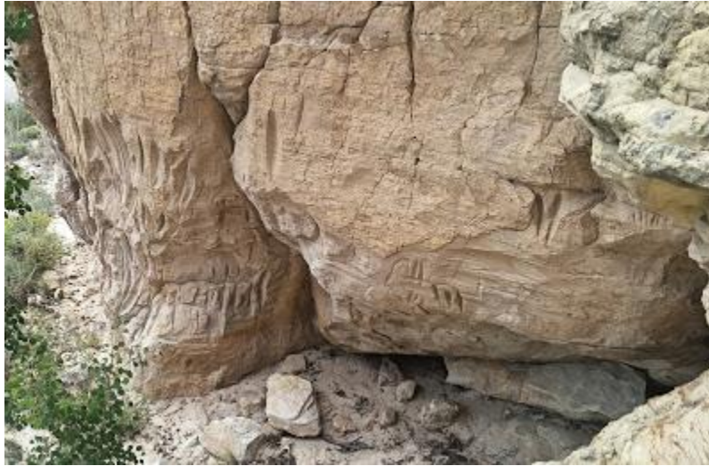
Almont rock art site, CO. Photo, Jared Allen, 2016.

I recently received some fascinating pictures and information from Jared Allen. Jared shared some photographs of a rock art site near Almont, in Gunnison County, Colorado. A couple of the photos show deeply incised grooves or the sort usually defined as tool sharpening grooves, although some of the grooves appear to be arranged purposefully to create a tree-like image. Much more interesting, however, are a couple of Jared's photographs that illustrate what appear to be Navajo Yei (Holy People) figures. Almont is a considerable distance from the current region of Navajo habitation, so what gives here?