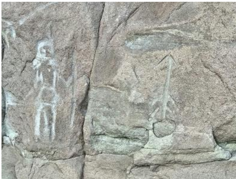
Almont rock art site, CO. Photo, Jared Allen, 2016.

I recently received some fascinating pictures and information from Jared Allen. Jared shared some photographs of a rock art site near Almont, in Gunnison County, Colorado. A couple of the photos show deeply incised grooves or the sort usually defined as tool sharpening grooves, although some of the grooves appear to be arranged purposefully to create a tree-like image. Much more interesting, however, are a couple of Jared's photographs that illustrate what appear to be Navajo Yei (Holy People) figures. Almont is a considerable distance from the current region of Navajo habitation, so what gives here?