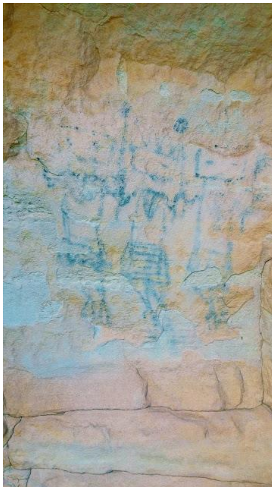
Almont rock art site, CO. Recurved bow held by figure on the right. Photo, Jared Allen, 2016.

Almont, Colorado, is approximately 9 miles north of the town of Gunnison, and 60 miles NW of Saguache. Some references place the early Navajo and the boundaries of Dinétah, the Navajo homeland, far enough north and east of their present territory that it includes the San Luis Valley in south/central Colorado. "Dinétah encompasses a large area of northwestern New Mexico, southwestern Colorado, southeastern Utah, and northeastern Arizona. The boundaries are inexact, and are generally marked by mountain peaks which correspond to the four cardinal directions." (Wikipedia) Indeed, Mount Blanca, one of the Navajo four holy mountains is located in the Sangre de Cristo mountain range on the east side of the San Luis Valley.