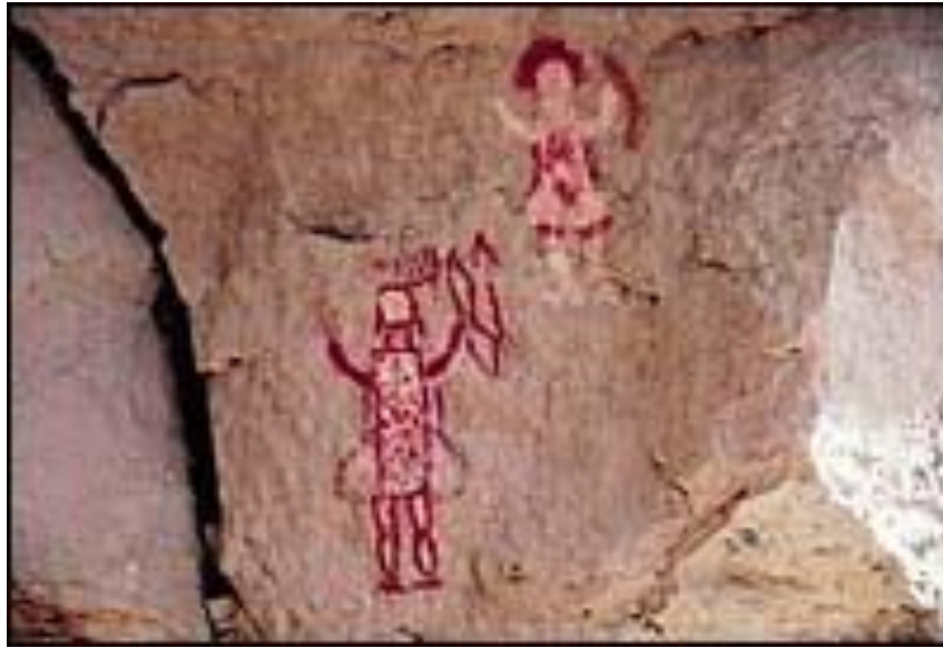
Yei pictographs showing recurved bow, Delgadito Canyon. Picture from www.nm.blm.gov/ .

"In Navajo tradition, the Holy People, or Yeis, are sometimes shown holding "recurved" bows. This technological innovation is thought by some to have been introduced by the ancestors of today's Navajo and Apache. The distinctive double curve is sometimes shown alone as a symbol for Naayee' Neizghani, or Monster Slayer, one of the Hero Twins." ( www.nm.blm.gov/ )