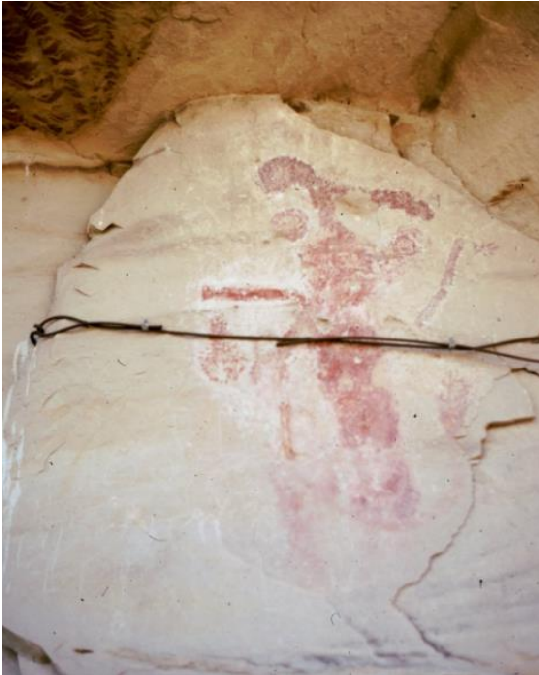
Kokopelli, Canyon Pintado, Rio Blanco County, CO. Photograph: Peter Faris, September 1990.