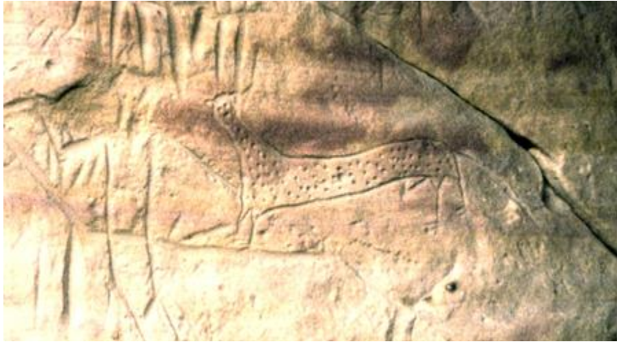
Spotted cat petroglyph, Farrington Springs, Bent County, CO. Photo Peter Faris, 1990.

On May 1, 2009, I posted a column on http://rockartblog.blogspot.com titled "A Spotted Cat Petroglyph In Southeastern Colorado." In this I showed a petroglyph from the marvelous rock art site of Farrington Springs and speculated as to exactly what it represents. The petroglyph, of an animal covered with spots and with a long tail and small ears appears to represent a cat, so then we ask ourselves what kind of cat? The first guess of a spotted cat that might live in that locale would be a young bobcat as they are covered with spots. Bobcats, however, have short little stubby tails, and this cat has a long tail sticking out behind him. Also, this animal is obviously not meant to represent a young animal as it has the phallus of a fully grown male animal.