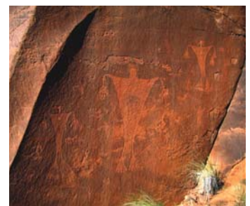
Paradox Valley Rock Art