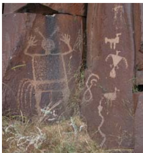
New Mexico Rock Art