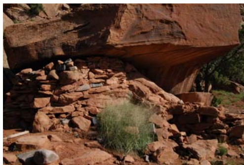
Rock shelter in Dominguez Canyon