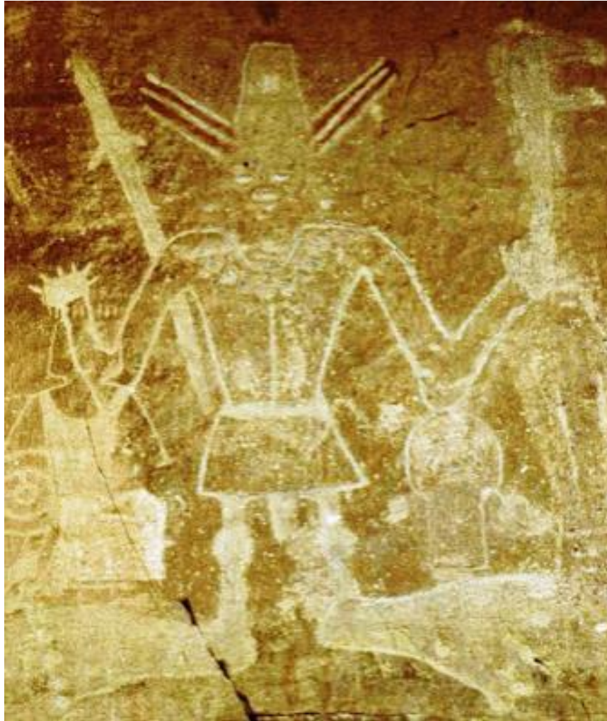
Bigfoot man, McConkie Ranch, near Vernal, UT.