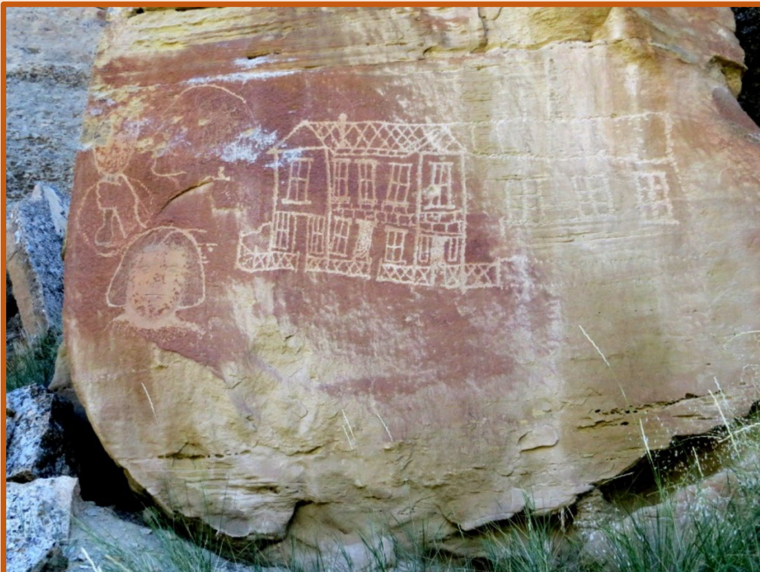
Two faces From Plateau Creek on private land.