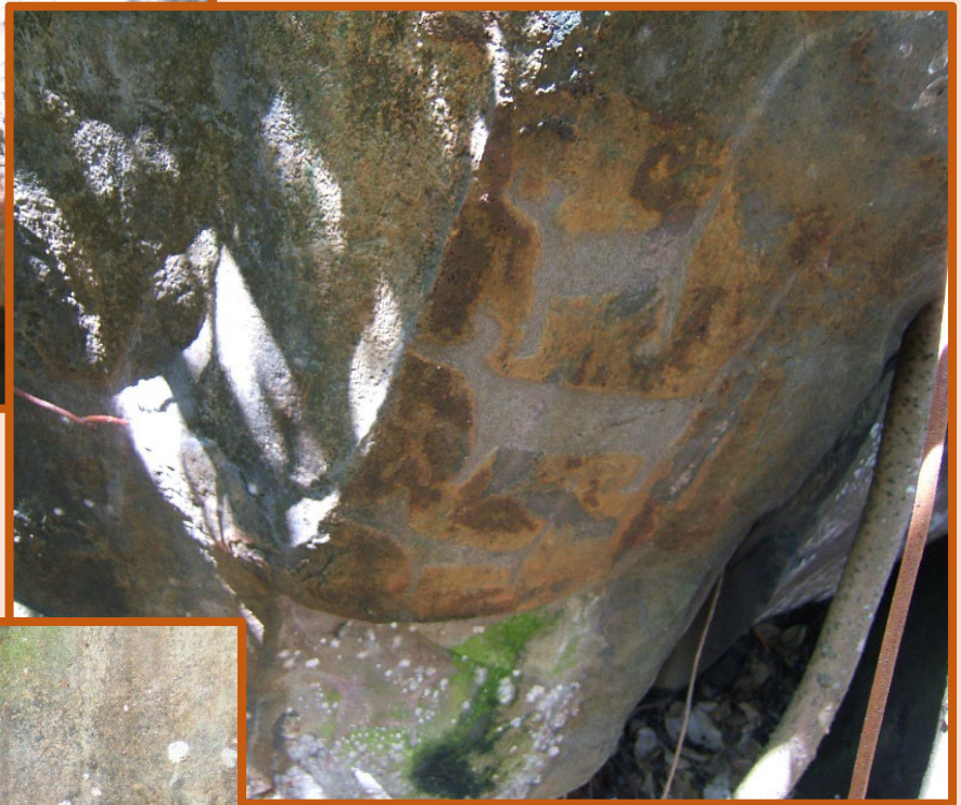
The art from Hawaii is mostly of dogs