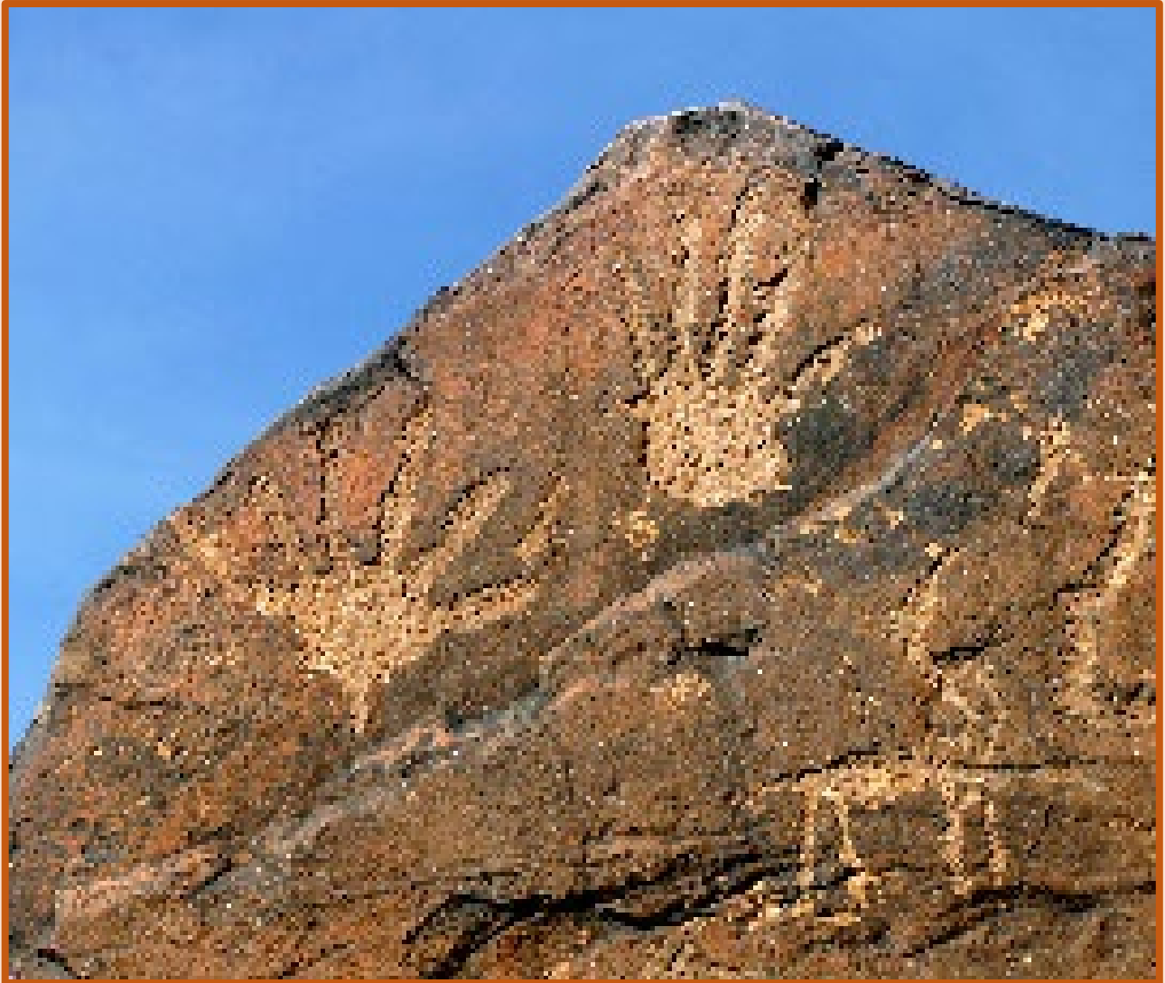
"6 Fingers" Las Animas, CO