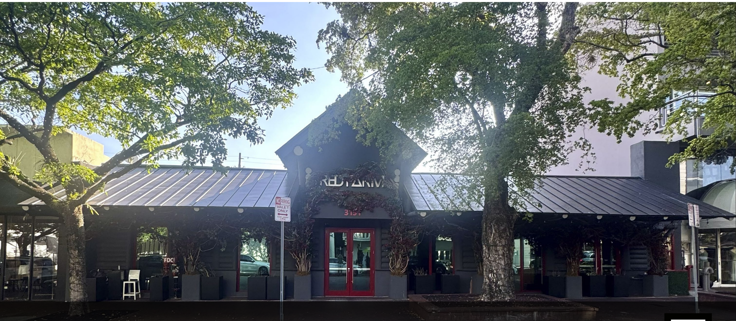
ABL REAL ESTATE PARTNERS ACQUIRES 2 nd PROPERTY IN THE HEART OF COCONUT GROVE AT 3131 COMMODORE PLAZA