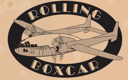
Rolling History to the Vets Who Helped Make It