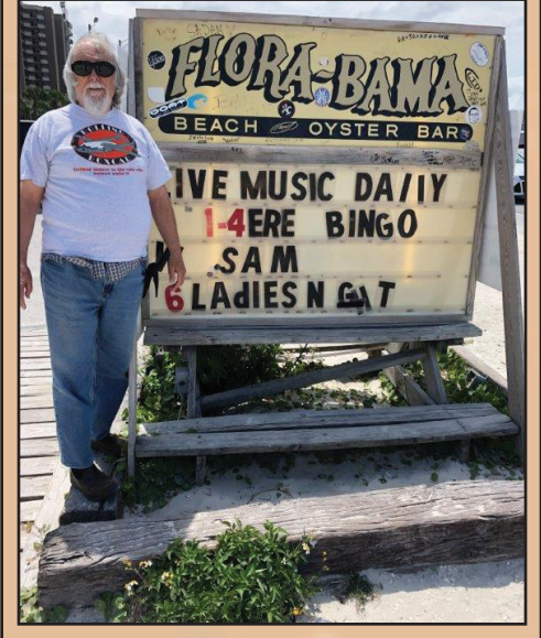
The "Dean of Drums" can't stop wearing his Rolling Boxcar T-shirt and he does so wherever he goes!