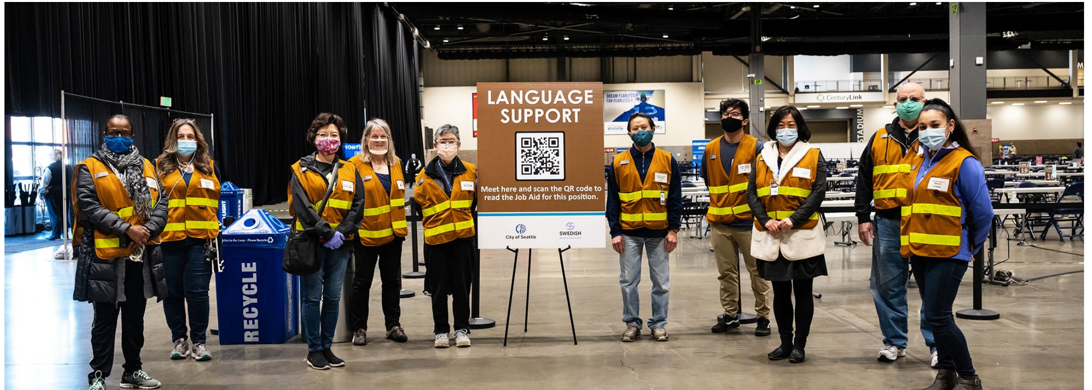
Interpreters from Adam's Interpreting Services, a women-owned firm that provided interpretation at Lumen Field.