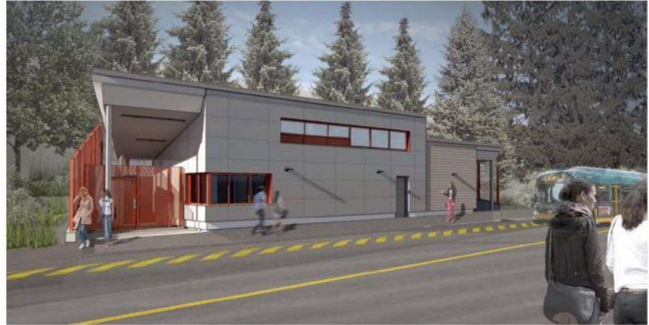
Eastlake Layover Facility design rendering.