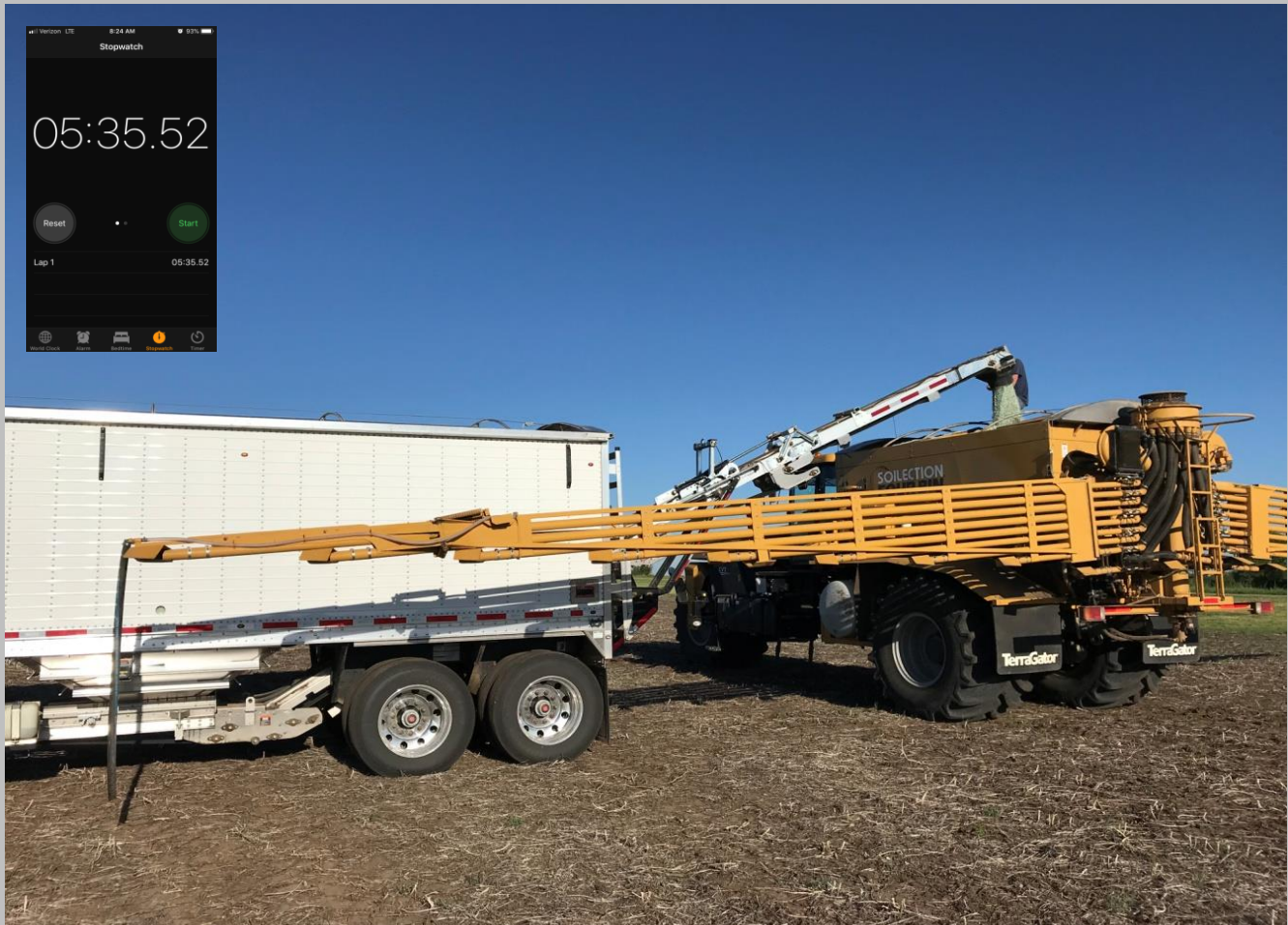
Actual Fill Time - 5:35 - with No product left on the ground

Regulated, No Spill Doors - Our door seals are designed to make unloading a stress-free process. Don't worry about metering your traps, or spilling product under the hoppers & through the transition. Product levelers keep the material from overfilling the belts & spilling on the ground.