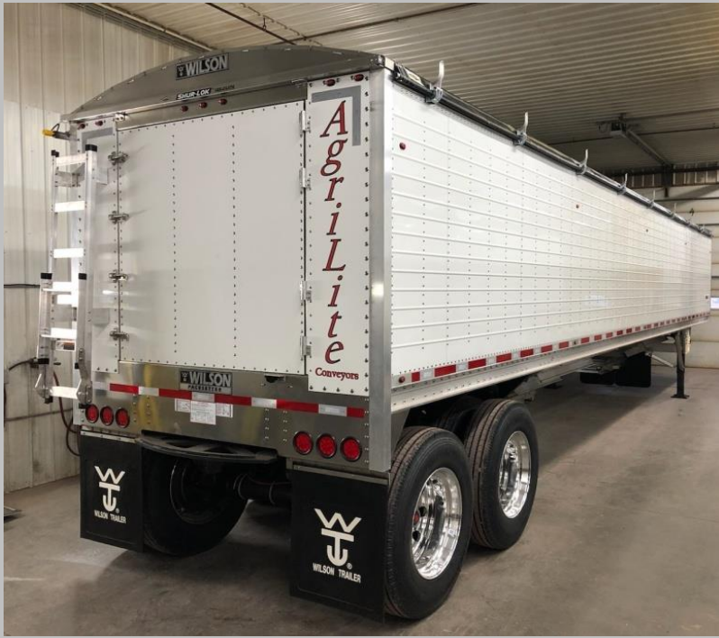
QuickLatch Rear Door