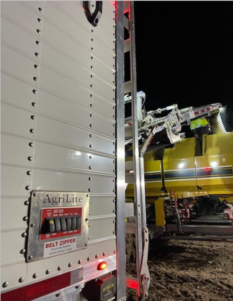
Standard Control Panel - Electric Switches at Rear of Trailer

*Split Hoppers for more Compartments on Any trailer*