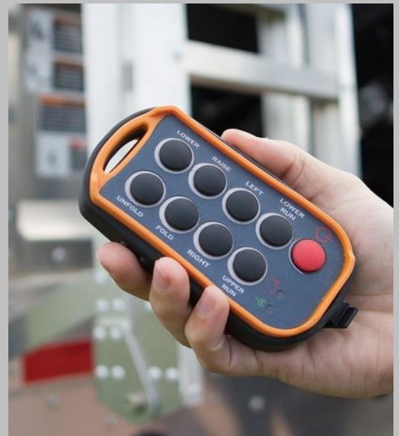
Optional Hydraulic Remote

Wilson Pacesetter 42' with Conveyor 11,960 lbs