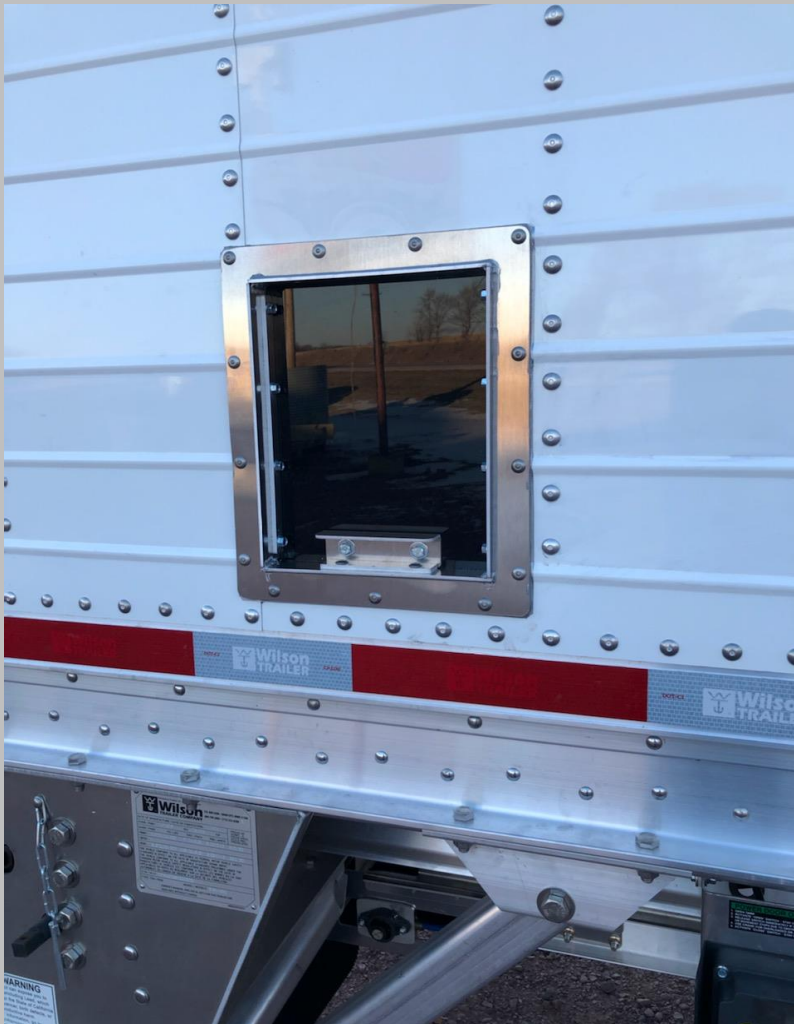
Clean Out Windows