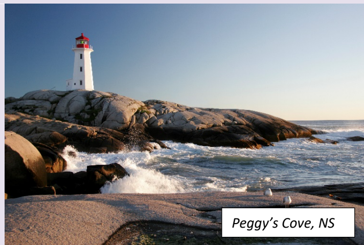
Peggy's Cove, NS