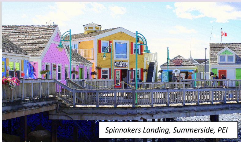
Spinnakers Landing, Summerside, PEI