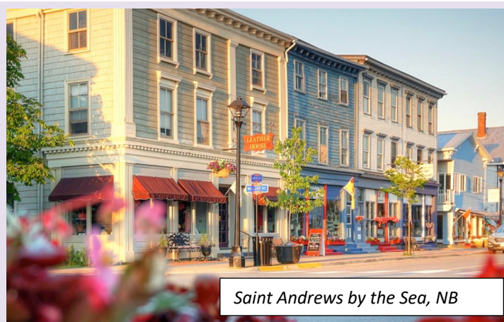
Saint Andrews by the Sea, NB