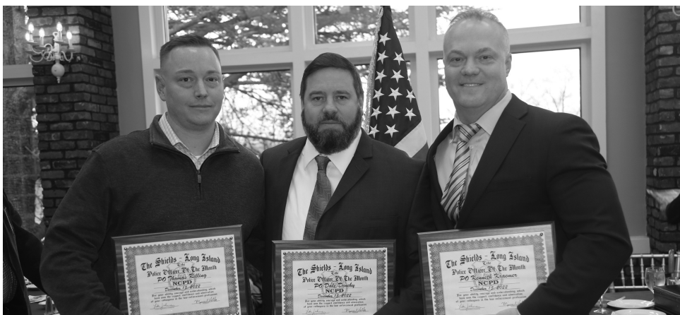
Police officers of the Month