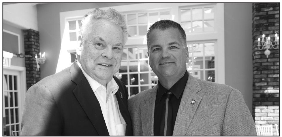
Ex Congressman Peter King