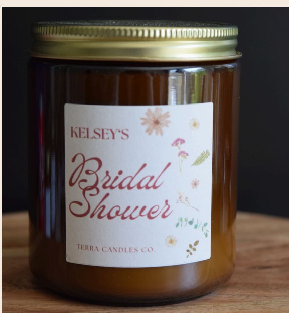
4 OZ STRAIGHT SIDED JAR (CLEAR OR AMBER)

MATERIAL: TIN PLATED STEEL (GOLD LID) BURN TIME: 20+ HOURS SIZE: 1.5" TALL x 2" WIDE PRICING: $4.55/CANDLE