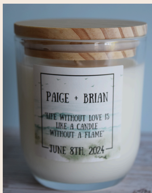
6 OZ CLEAR JAR WITH WOOD LID

MATERIAL: GLASS JAR, METAL LID : GOLD BURN TIME: 20+ HOURS SIZE: 2.71" TALL X 2.32" WIDE PRICING: $5.55/CANDLE