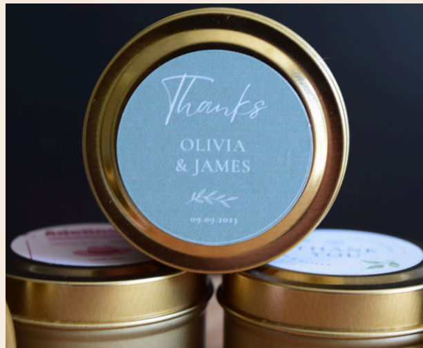
2 OZ TIN

MATERIAL: AMBER GLASS BOTTLE, GOLD PLASTIC MISTING CRAP SIZE: 5.4" TALL X 2" WIDE PRICING: $7.20/SPRAY