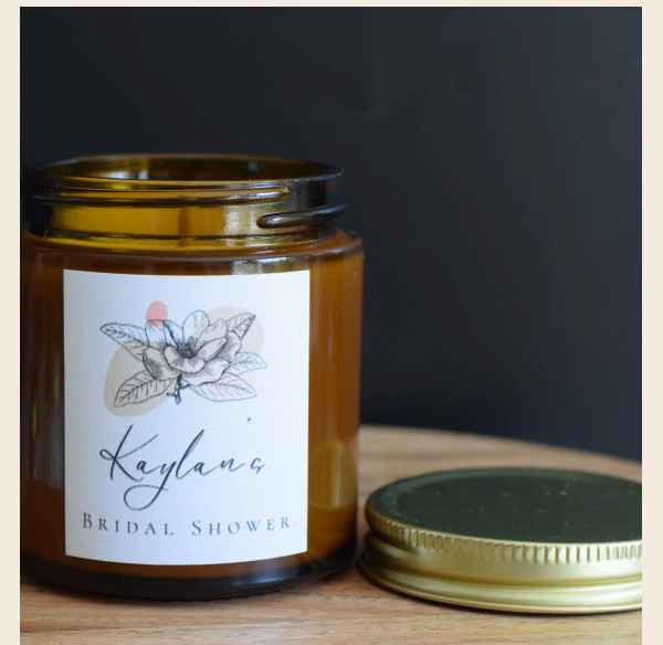
2 OZ STRAIGHT SIDED JAR (CLEAR OR AMBER)

MATERIAL: TIN PLATED STEEL (BLACK, GOLD OR SILVER) BURN TIME: 20+ HOURS SIZE: 1 3/8 TALL X 1 1/2" WIDE PRICING: $4.30 /CANDLE