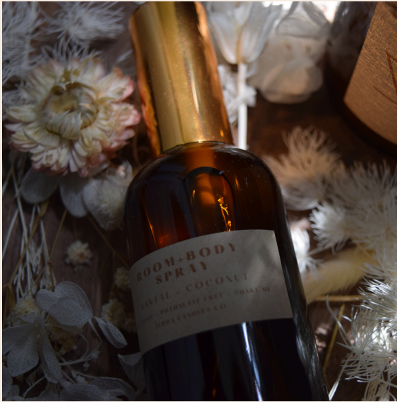
4 OZ ROOM SPRAY