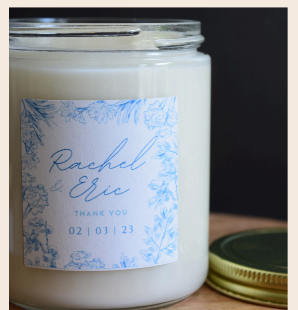
8 OZ STRAIGHT SIDED JAR (CLEAR OR AMBER)

MATERIAL: GLASS JAR BURN TIME: 35+ HOURS SIZE: 2.5" TALL X 3.15" WIDE PRICING: $7.90/CANDLE