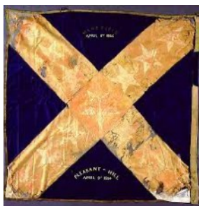
14th Texas Infantry