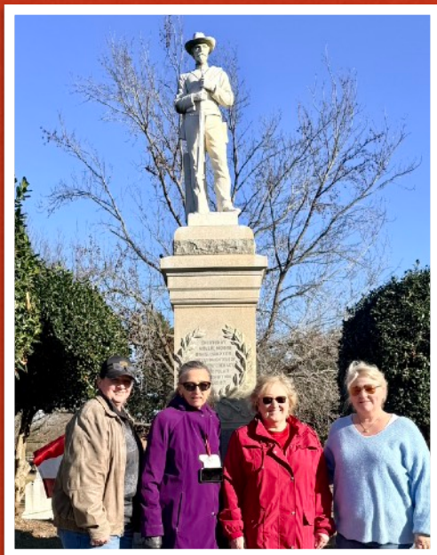
Members of Mollie Moore Davis 217 U.D.C.