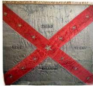
3rd Texas Infantry.