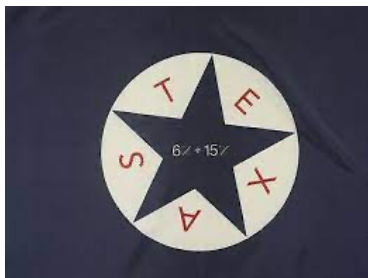
15th Texas Infantry