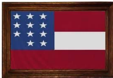
11th Texas Infantry