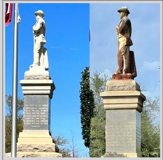
After 3 months the D2 monument cleaner we applied to the monument has fully completed its work!