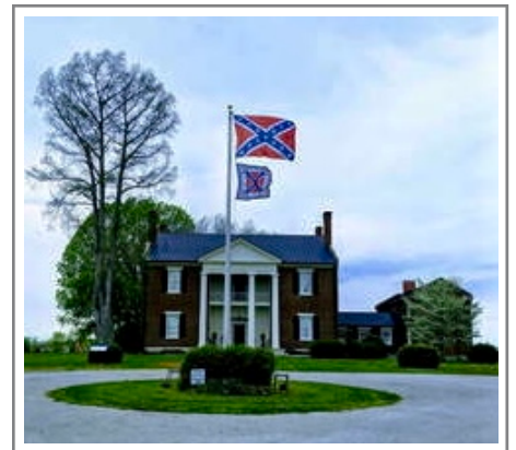
SCV Headquarters - Elm Springs