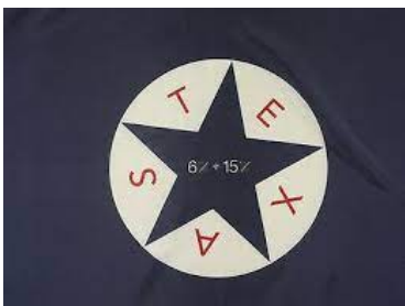
15th Texas Infantry