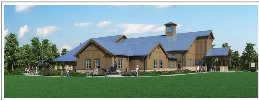
The beautiful National Confederate Museum located adjacent to Elm Springs on the 88 acre Southern Heritage Center Campus