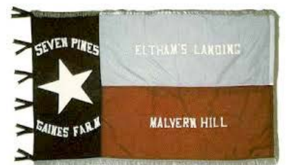
1st Texas Infantry