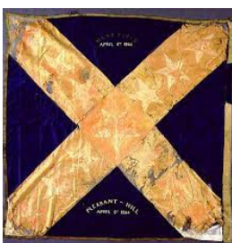
14th Texas Infantry