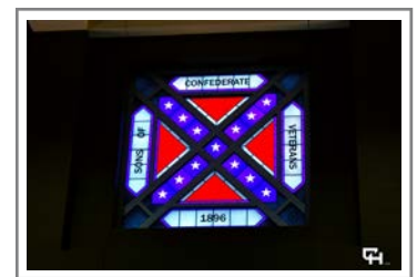
Stained glass SCV Logo located inside the museum