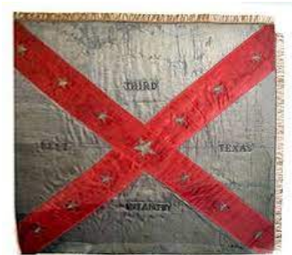
3rd Texas Infantry