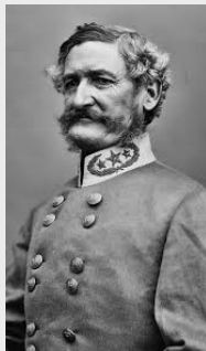
Brigadier General Henry Sibley