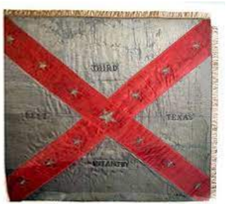
3rd Texas Infantry