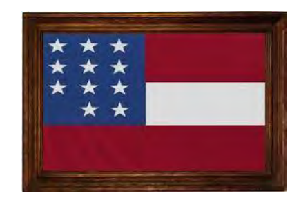
11th Texas Infantry