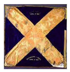
14th Texas Infantry