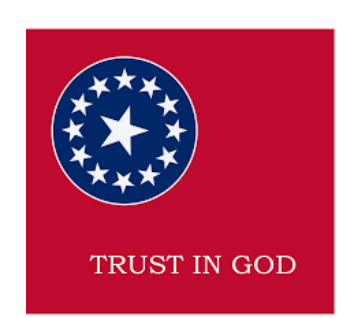
17th Texas Infantry.