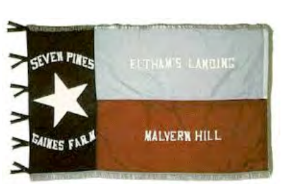
ıst Texas Infantry