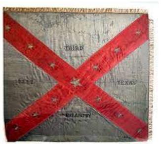
3rd Texas Infantry