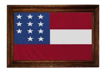
11th Texas Infantry