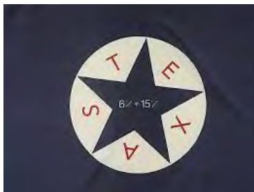
15th Texas Infantry