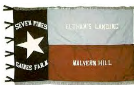
1st Texas Infantry