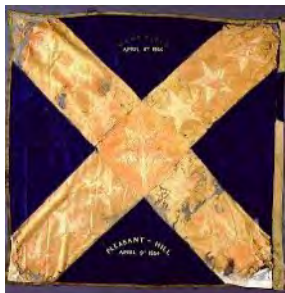
14th Texas Infantry