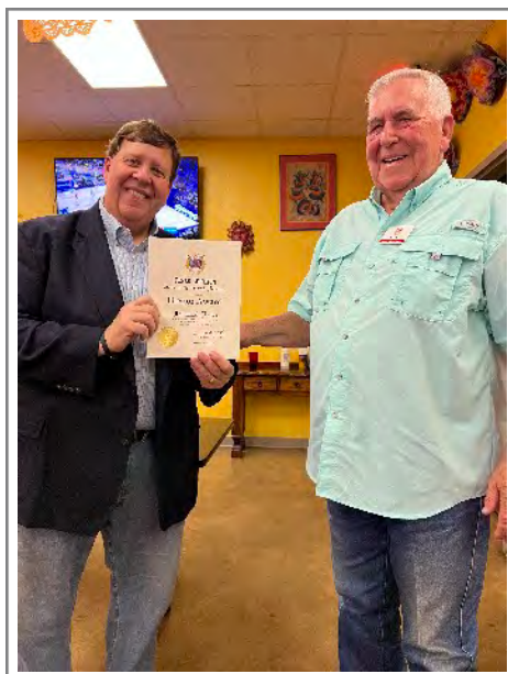
Bill Hurley Honor Award for Service