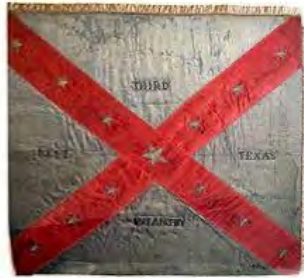
3rd Texas Infantry.