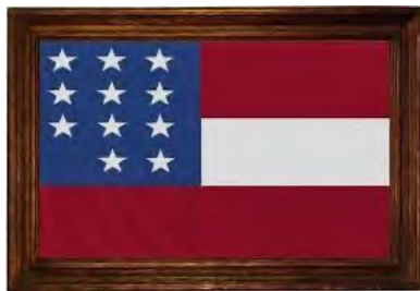
11th Texas Infantry