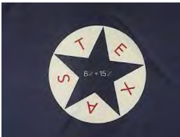
15th Texas Infantry