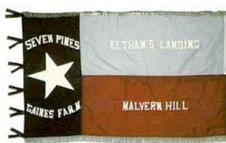
1st Texas Infantry