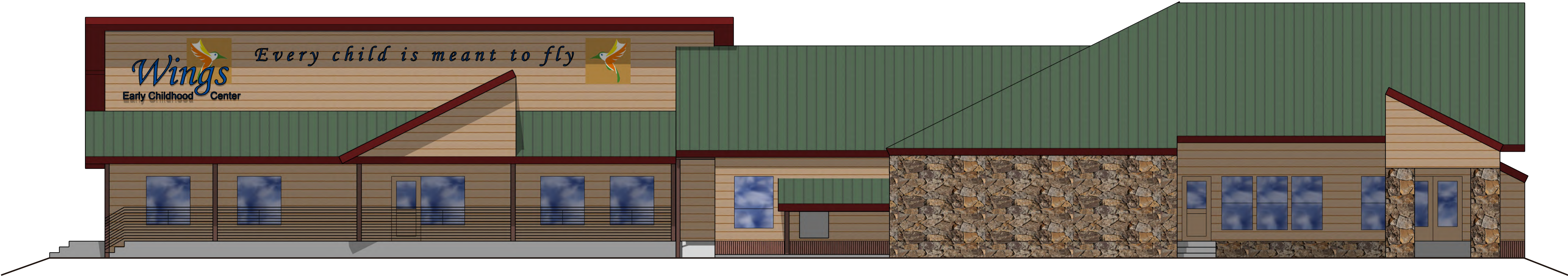
OVERALL SOUTH ELEVATION