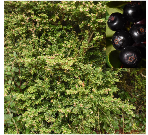
evergreen huckleberry Vaccinium ovatum Spring flowers, fall fruits