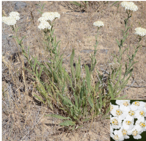
yarrow Achillea millefolium Long blooms, beneficials