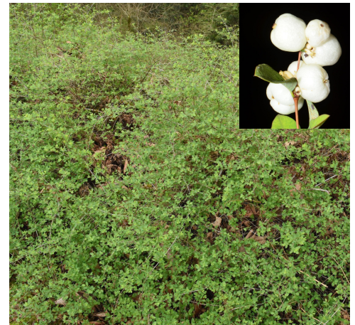
snowberry Symphoricarpos albus Winter fruits, birds