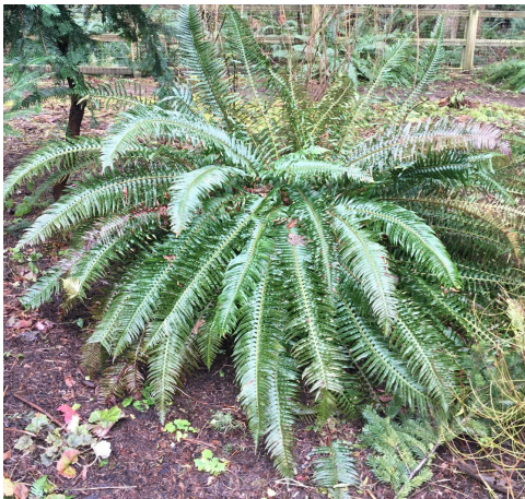
sword fern Polystichum munitum Small mammals, insects