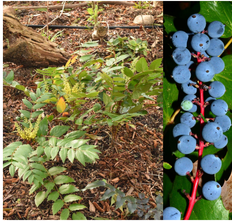
Oregon grape Mahonia nervosa Habitat and fruits