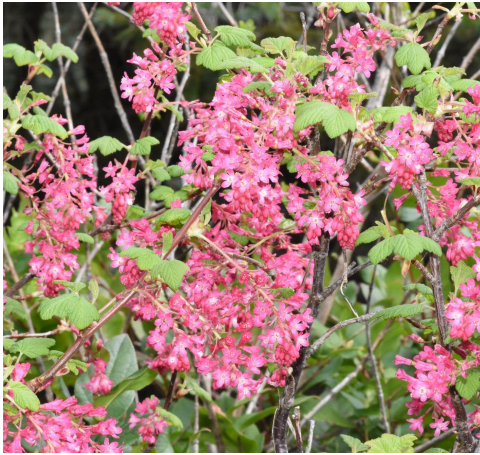
red-flowering currant Ribes sanguineum Hummingbirds