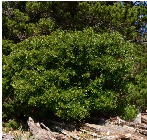
wax myrtle Morella californica Year-round cover