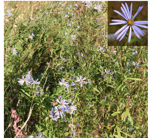
asters Symphyotrichum Butterflies, summer flowers