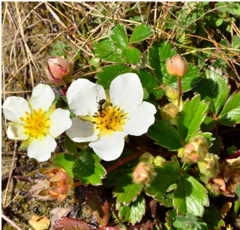
beach strawberry Fragaria chiloensis Groundcover, edible fruits