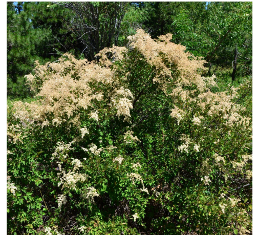
ocean-spray Holodiscus discolor Shrub, white flowers