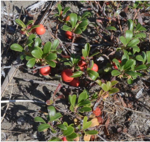
kinnikinnick Arctostaphylos uva-ursi Groundcover, red fall fruits