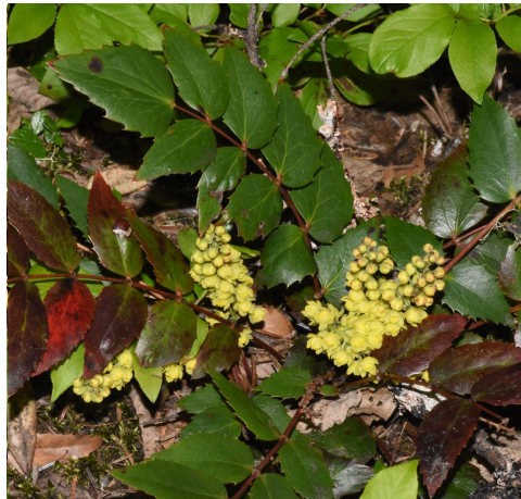
Oregon-grape Mahonia nervosa Shrub, evergreen