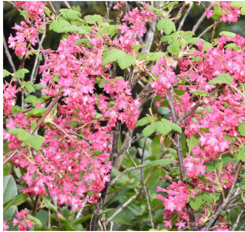
red flowering currant Ribes sanguineum Shrub, early spring flowering