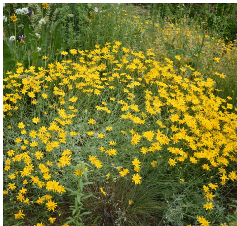
Oregon sunshine Eriophyllum lanatum Perennial, yellow fall flowers