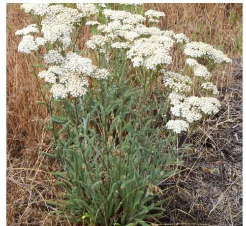
yarrow Achillea millefolium Perennial, gray foliage