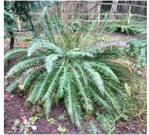
sword fern Polystichum munitum Perennial, iconic fern