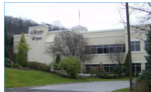
Bridgewater Manor, home of NJ SAMPE monthly meetings for 42 years.

In 1983, a new Wil-Phil Chapter was formed as a spin off from the NJ Chapter.