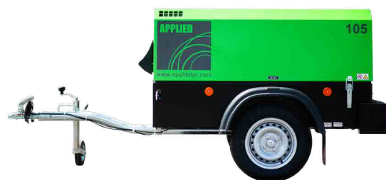
Version: Fixed tow bar