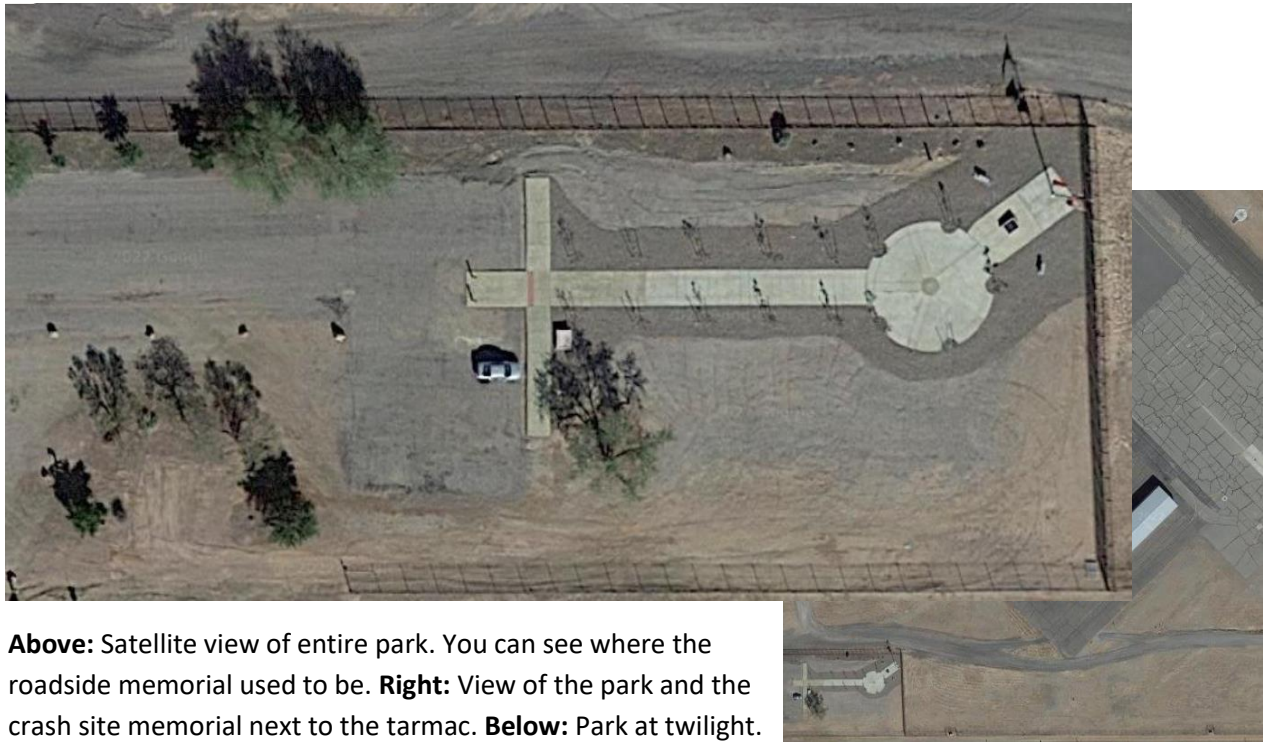
Above: Satellite view of entire park. You can see where the roadside memorial used to be. Right: View of the park and the crash site memorial next to the tarmac. Below: Park at twilight.

friendsofnighthawk72@hotmail.com • 520-982-0023