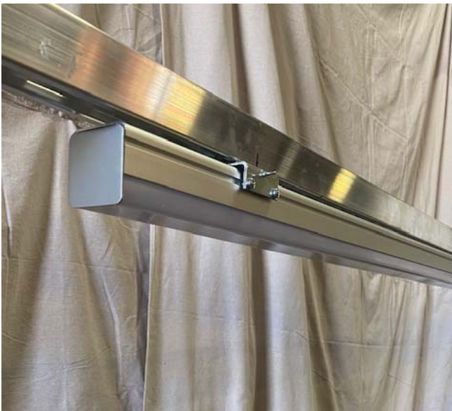
Airey-Thompson fixture securely installed to strut