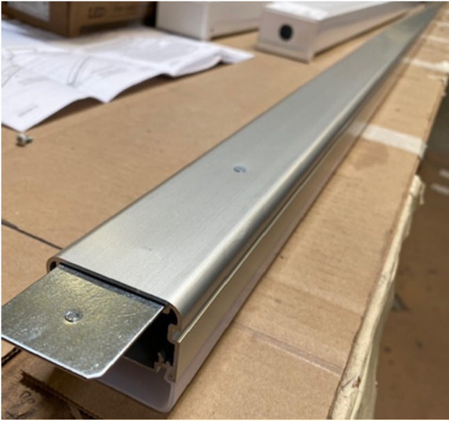
51L Smooth base void of any sharp edges