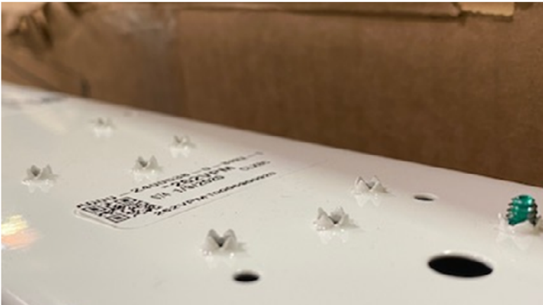
Strip fixture with sharp barbs and ground screw on the back of the housing present a safety hazard.

The Airey-Thompson fixtures came supplied with all of the needed hardware for this installation. The hangers came with strut nuts and mounting screws, fixtures were provided with through wires and wire connectors. This was a single tool installation only requiring a #2 Phillips head screw driver to tighten coupler set screw and hanger bracket screws.