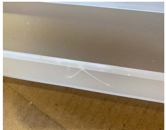
A crack on the other strip light lens