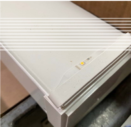
Broken lens on the strip light with exposed LED chips