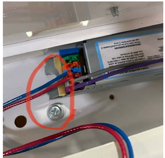
Strip light driver not installed properly, mounting screw not engaged with driver