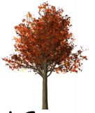
State Tree: Sugar Maple