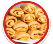
Eat a Pepperoni Roll