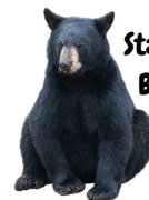
State Animal: Black Bear