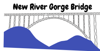
New River Gorge Bridge