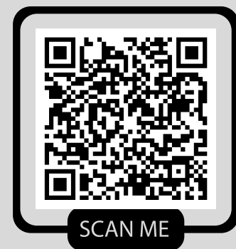
Photo Release Disclaimer

Check out our special video featuring fun facts, history, and sights from across the Great Lakes State—all with a Flat Soldier as your tour guide!