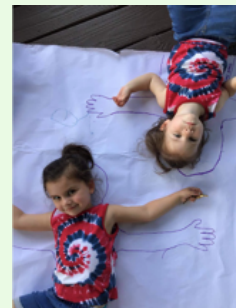
WV - Mail A Hug Kit ready to send to Daddy on Deployment