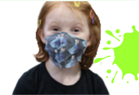
NV - Youth Resilience Training

This list does not indicate an endorsement of resources, programs and/or services by National Guard Bureau, DysTech, staff or contractors.