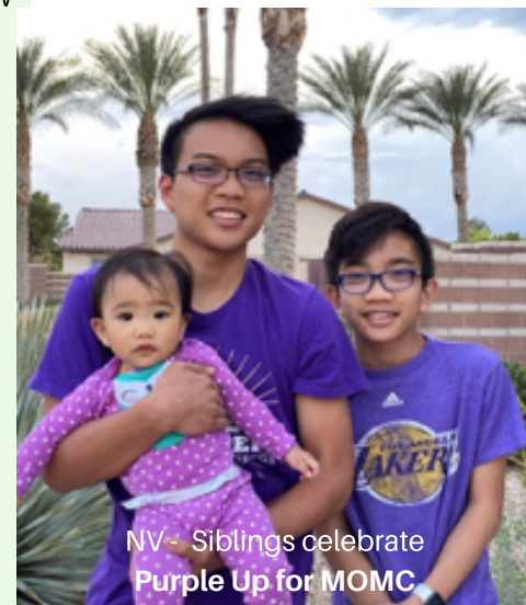
NV - Siblings celebrate Purple Up for MOMC