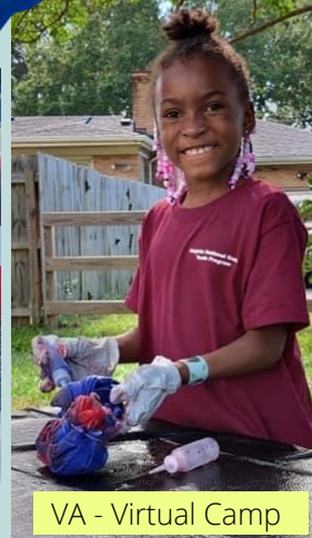
VA - Virtual Camp