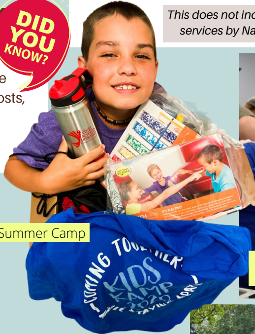
PR - Summer Camp