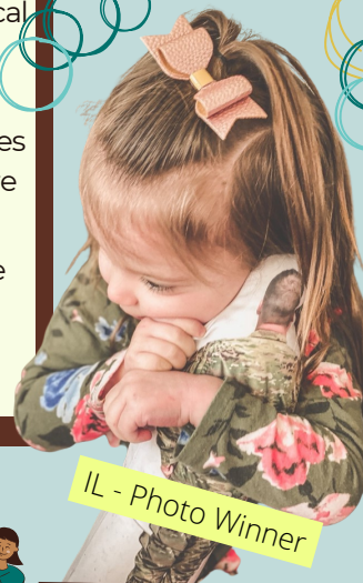
IL - Photo Winner

Do you want to stay up-to-date with the latest info? Be sure to subscribe here on our website