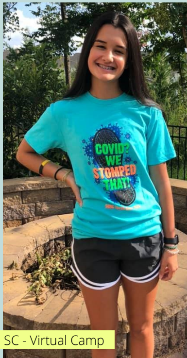
SC - Virtual Camp