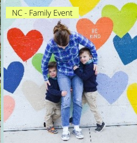
NC - Family Event