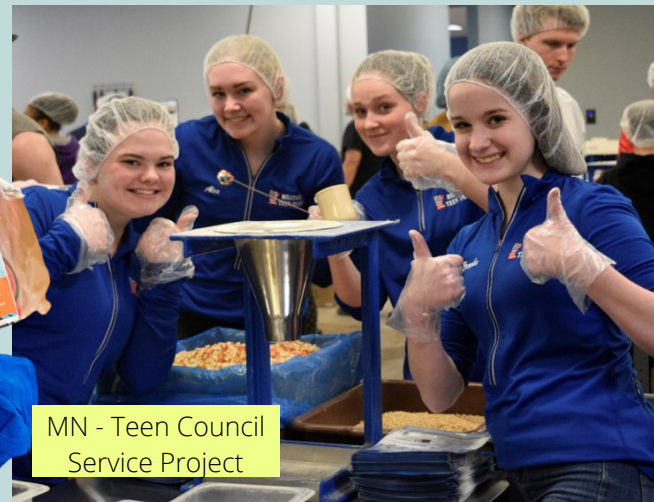
MN - Teen Council Service Project