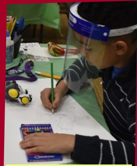
PR - Summer Camp