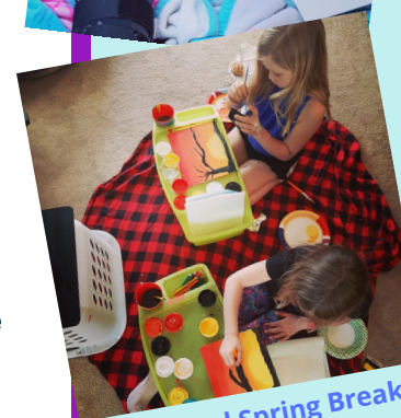
TX-Virtual Spring Break "Paint Day"