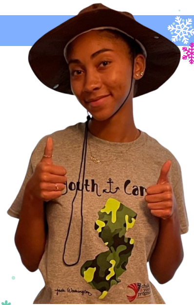
(New Jersey CYS)