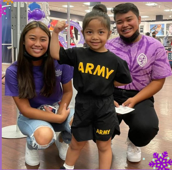
MOMC Event (Guam CYS)