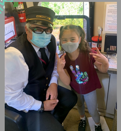
Adventure Day Camp (Alaska CYS)