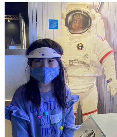
AZ CYS - Space Camp

Do you want to stay up-to-date with the latest info?