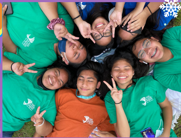
Resiliency Camp-Jr Leaders (Guam CYS)

Follow your local CYS social media accounts to see the weekly In the Know (ITK) posts, OR reach out to your local CYS Program for a copy. #ARNGCYSITK