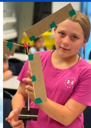
IL ARNG CYS