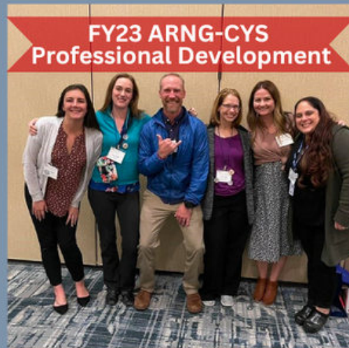
FY23 ARNG-CYS Professional Development