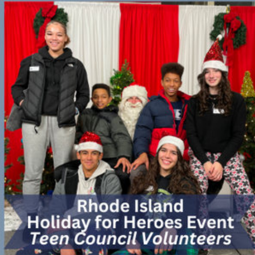
Rhode Island Holiday for Heroes Event Teen Council Volunteers