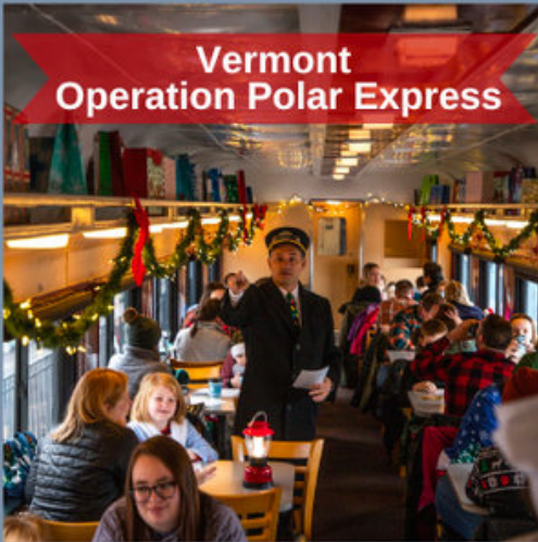
Vermont Operation Polar Express