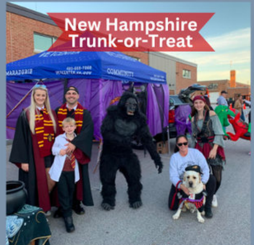
New Hampshire Trunk-or-Treat