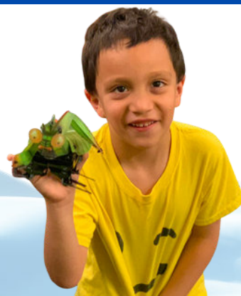
AZ ARNG CYS - STEM Day -