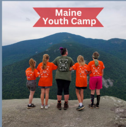
Maine Youth Camp