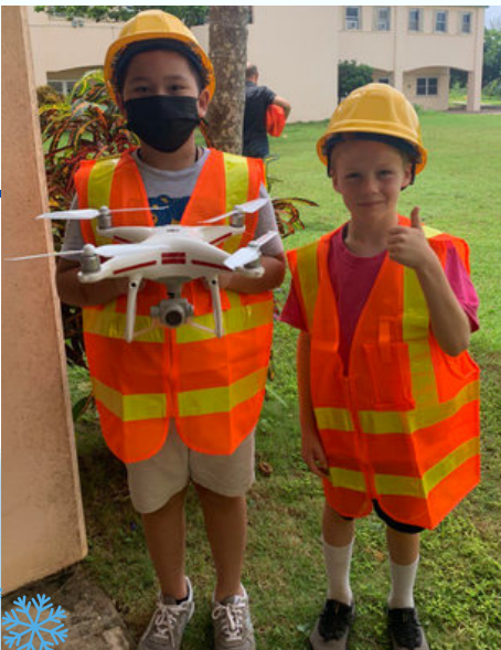
GU ARNG CYS

https://arngcys.com/my-local-cys-program