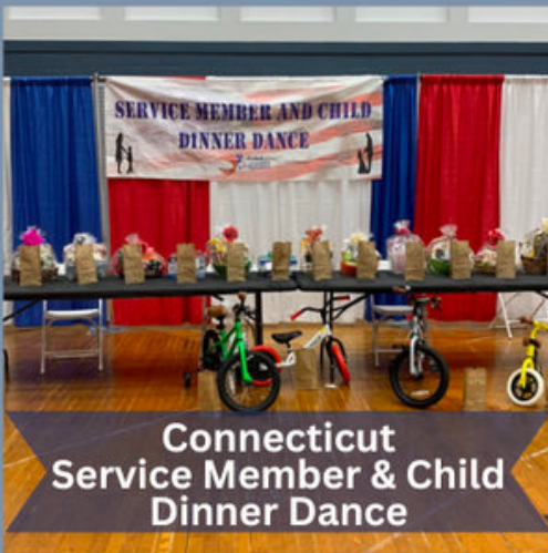
Connecticut Service Member & Child Dinner Dance