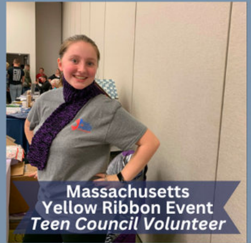
Massachusetts Yellow Ribbon Event Teen Council Volunteer