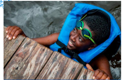
LA ARNG CYS