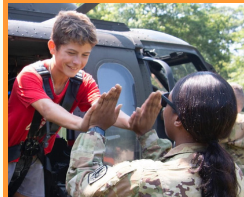
DE CYS - Teen Council