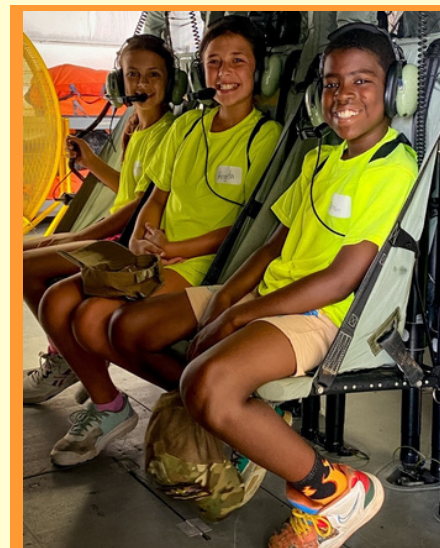
LA CYS - Camp Pelican Pride

Do you want to stay up-to-date with the latest info?