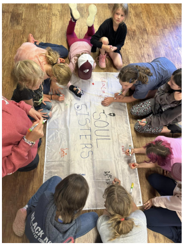
Summer Camp 2024