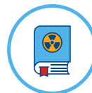
ACQUISITION OF EXPERTISE