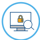
TESTING OR PROBING OF SECURITY