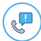
EXPRESSED OR IMPLIED THREAT

The NSI is a joint collaborative effort by DHS, the Federal Bureau of Investigation, and federal, state, and local law enforcement partners. It establishes standard processes and policies that allow law enforcement and homeland security agencies to share Suspicious Activity Reports through an information-sharing system. The initiative was set up in a manner that protects a person's privacy, civil rights, and civil liberties. To learn more, visit www.dhs.gov/NSI .