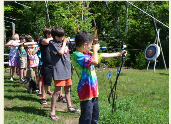
NEW HAMPSHIRE NATIONAL GUARD CHILD & YOUTH PROGRAM'S SUMMER CAMP 2021

3 - "Virtually Wild" educational animal programs were taught, via Zoom, to Military Youth by Squam Lakes Natural Science Center.