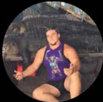
"ZZ" Loupe Louisiana Alligator & Gar Guide