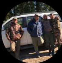
Argentina Waterfowl Guides