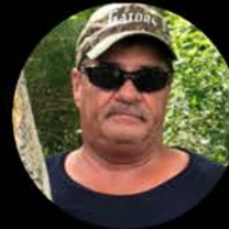
Tattoo Louisiana Alligator Guide & Cajun Storyteller