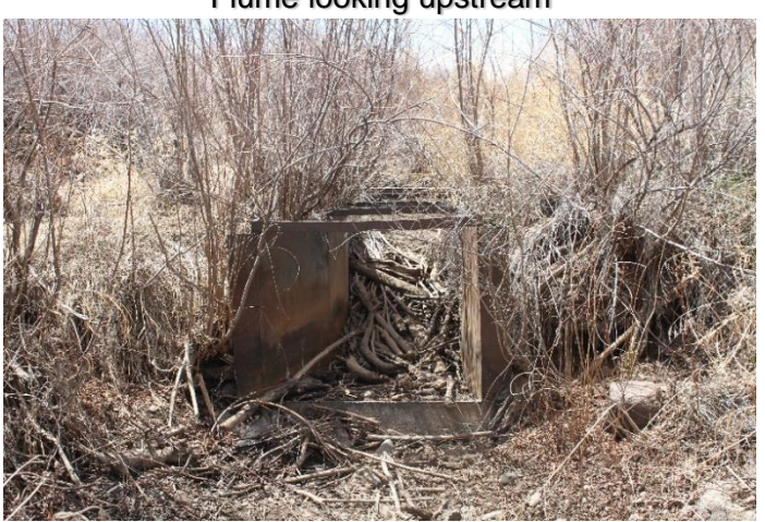
Flume looking upstream