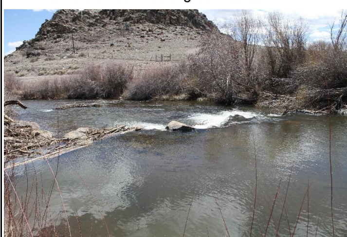
Diversion dam looking downstream