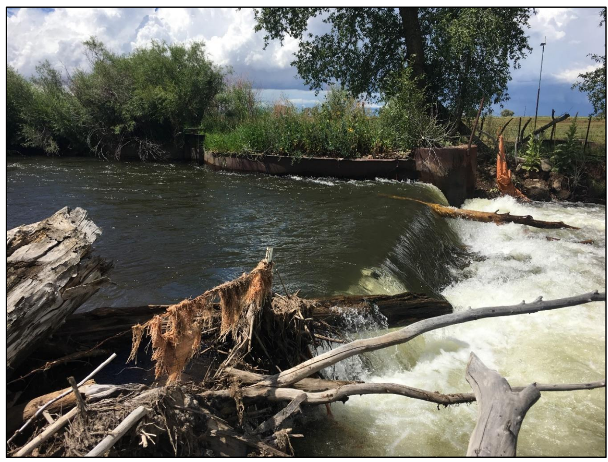
Diversion dam and headgate (post-2019 runoff)