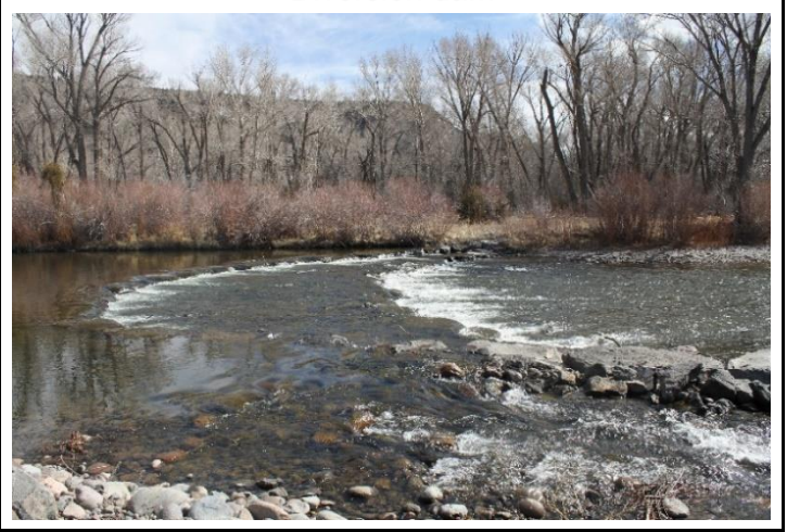
Flume looking upstream