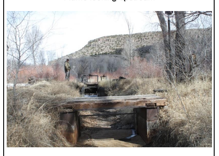
CONEJOS RIVER DIVERSION INFRASTRUCTURE INVENTORY