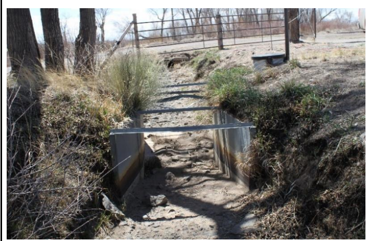
CONEJOS RIVER DIVERSION INFRASTRUCTURE INVENTORY