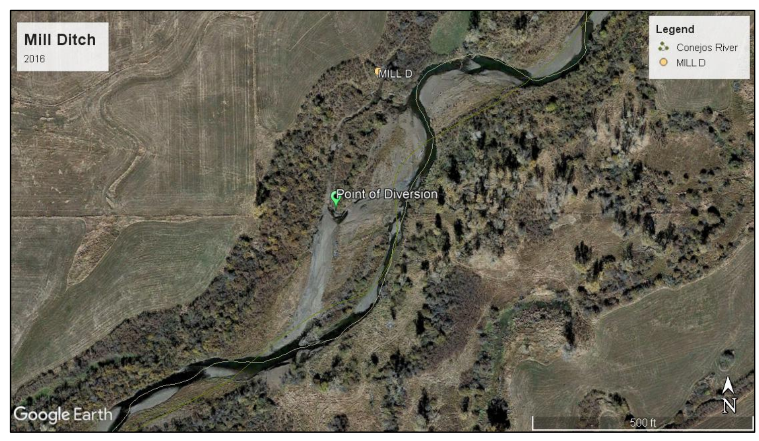
Mill Ditch point of diversion and headgate location (2016 imagery)