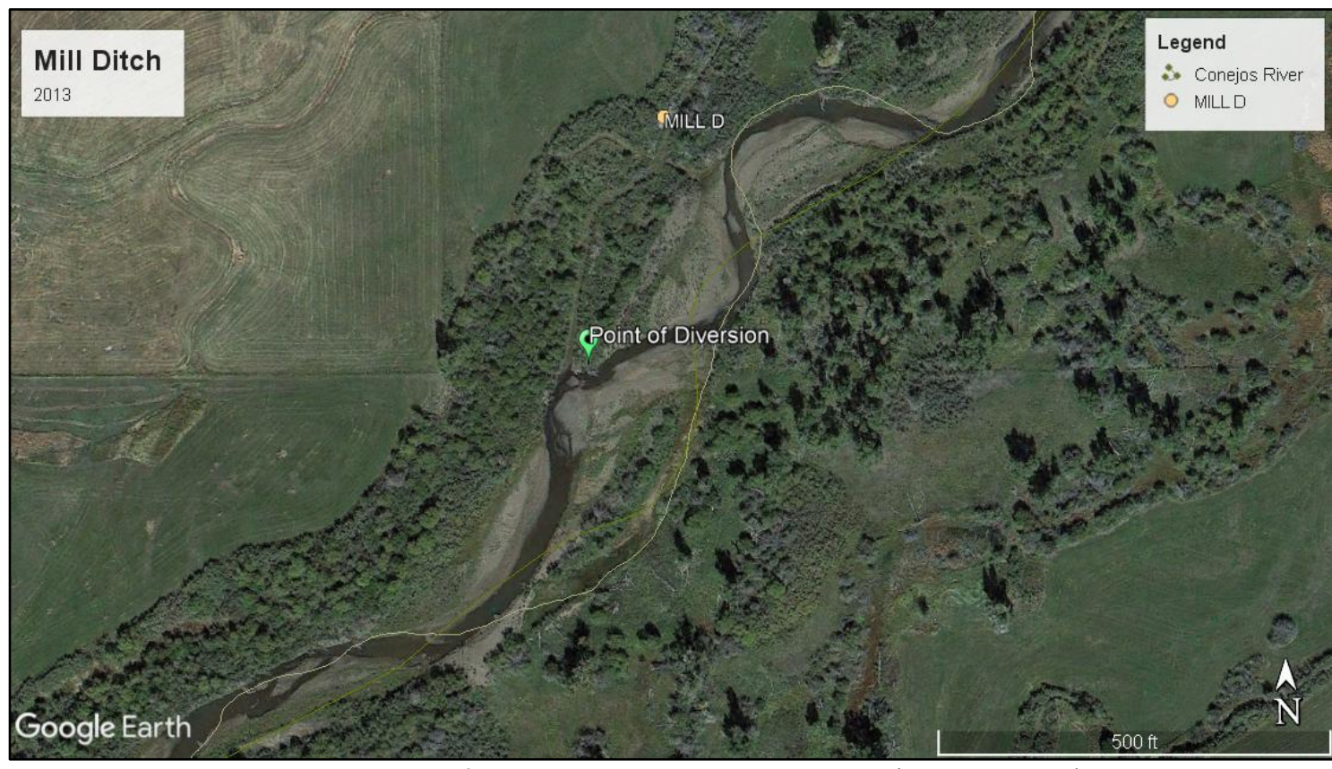
Mill Ditch point of diversion and headgate location (2013 imagery)