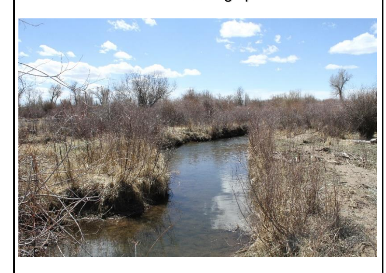
Feeder ditch looking upstream