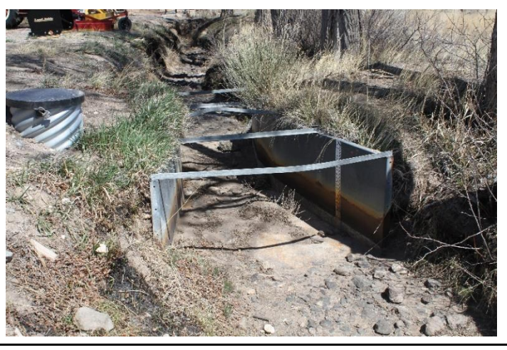
Flume looking downstream