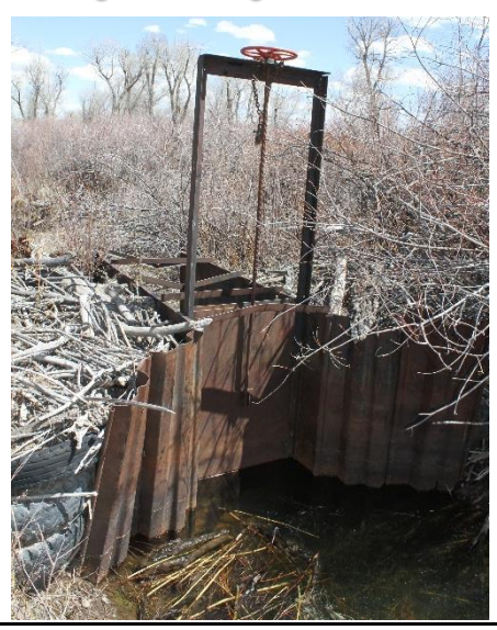
Headgate looking downstream