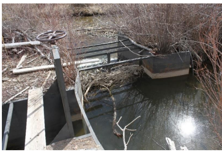
Flume looking upstream