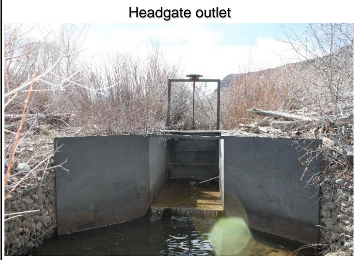
Diversion dam on feeder ditch looking downstream