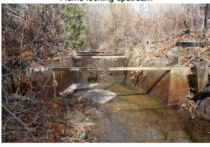
CONEJOS RIVER DIVERSION INFRASTRUCTURE INVENTORY