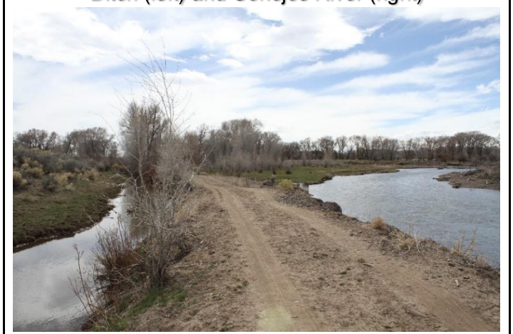
CONEJOS RIVER DIVERSION INFRASTRUCTURE INVENTORY