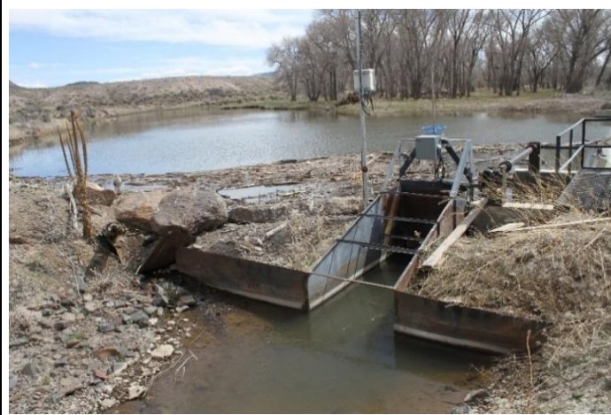
Flume looking upstream