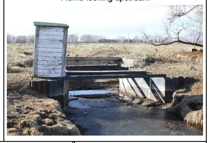
RIO GRANDE DIVERSION INFRASTRUCTURE INVENTORY