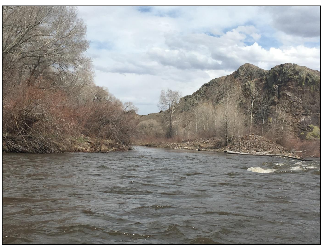
Diversion dam and feeder channel entrance during high flow in spring 2019