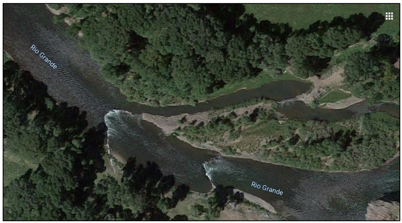
Aerial imagery from 2018 showing diversion dam and downstream bank stabilization structure.