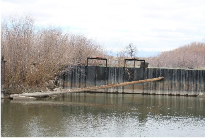
Headgate looking downstream